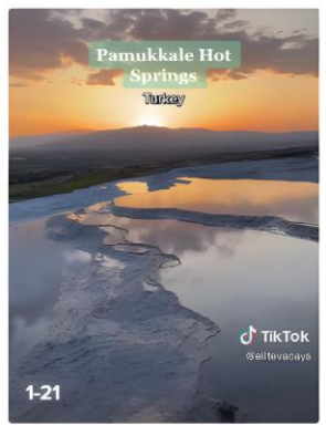
Would you add this place to your travel bucket list? 🌊... elitevacays 1.3M