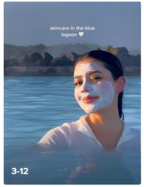
a whole different level of serenity 🧘🏻💕 #skincare...