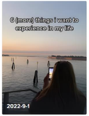
i could make these videos forever #travelbucketlist...